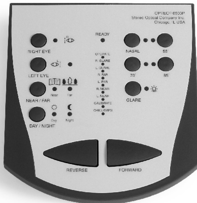
Model 6500 Control Panel

This switch determines direction of the slide advancement. Pressing this switch once advances test slides one at a time. Holding this switch down allows for continual advancement of the test slides until the desired slide is in the correct position.